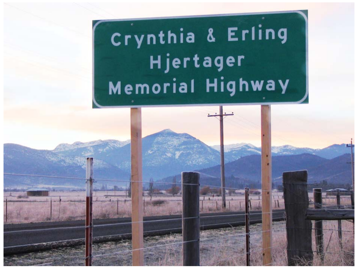
State Highway Route 3, Siskiyou County